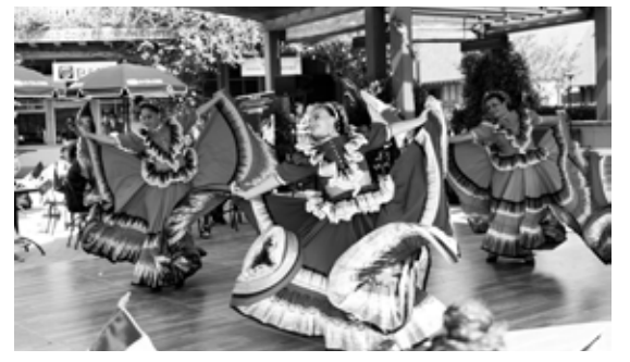
Mexican Independence Day Celebration, 2022.

MEXICAN INDEPENDENCE DAY CELEBRATION Saturday, September 16 11:00 a.m. - 1:30 p.m.